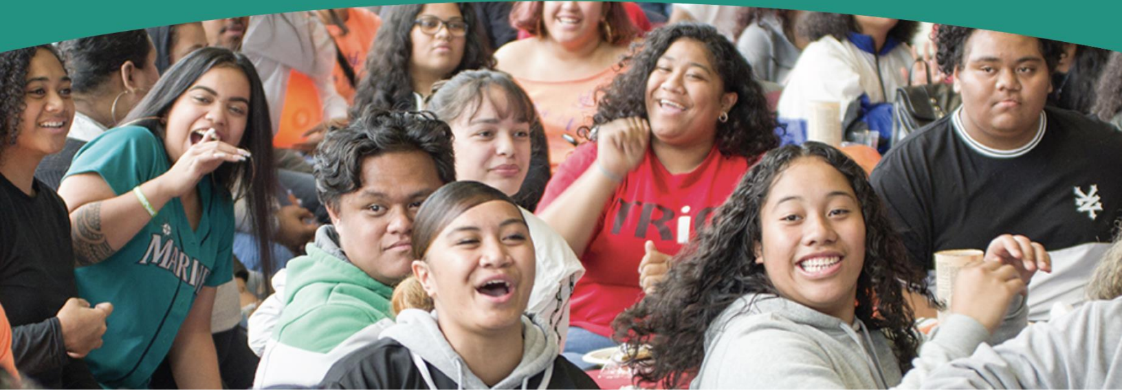
Our Future Matters.