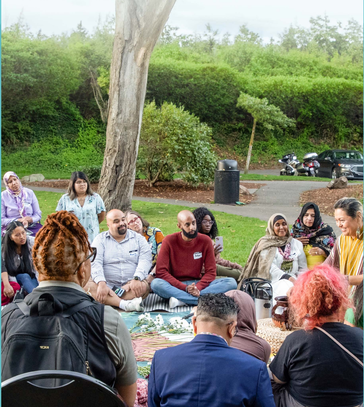
Community members gather at Neighbor 2 Neighbor's annual convening.