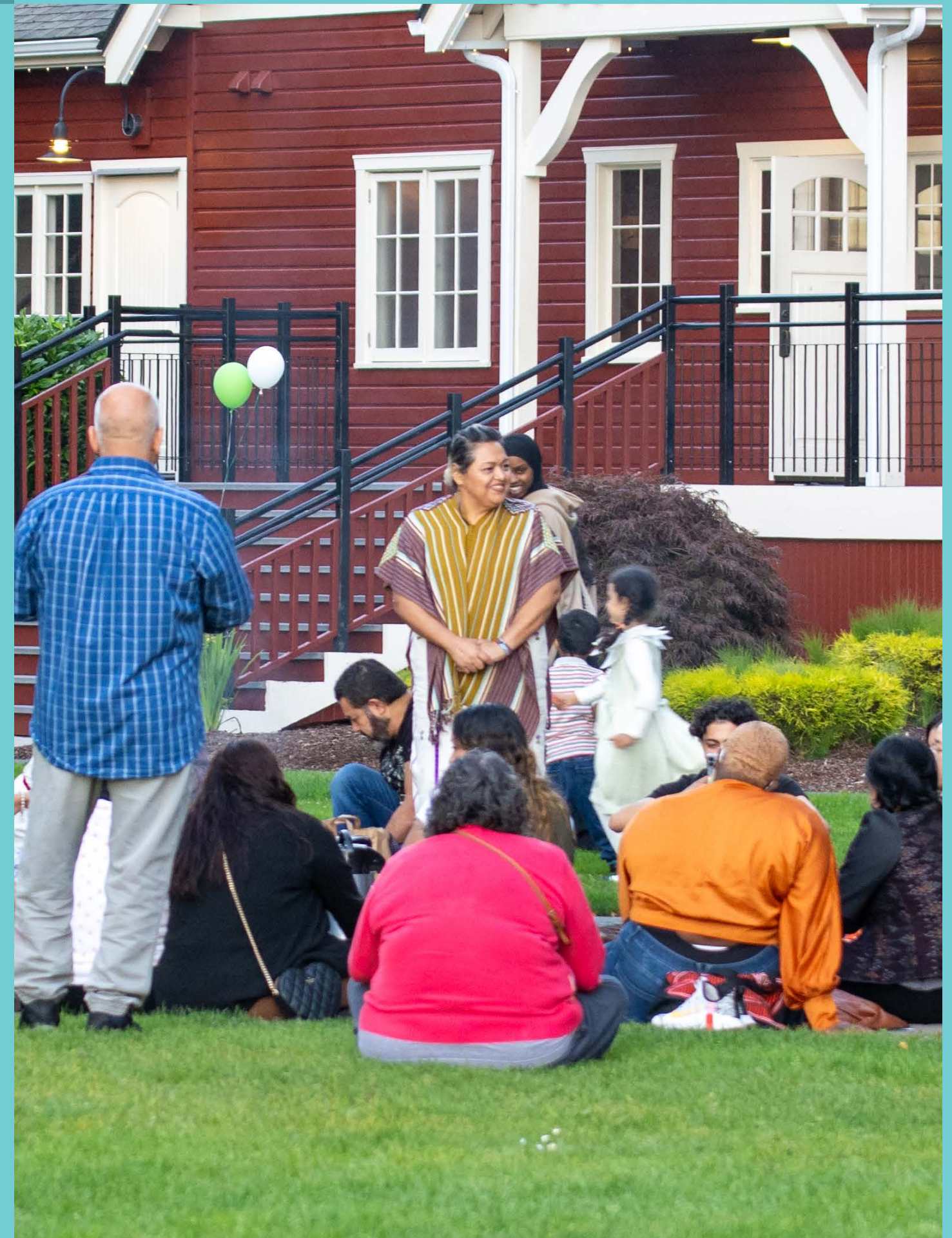
Community members gather for a healing ceremony led by Casa Surya Healings at the Neighbor 2 Neighbor's annual convening

WA (not including Seattle and King County)