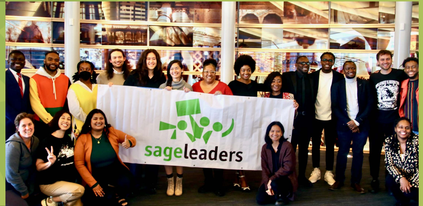
Sage Leaders, a 501(c)(4) nonprofit affiliated with Puget Sound Sage

BIPOC ED Coalition awarded $1.37 million toward 20 three-month sabbaticals for their inaugural cohort of BIPOC nonprofit leaders, along with 12 one-month Respite awards. Their sabbatical program also provided approximately 25 hours of capacity-building coaching to the leader and organization. Focus areas of this coaching included creating a plan to manage the leader's responsibilities during sabbatical; providing leadership skill-building for staff, board and interim leaders; and exploring leadership-sharing and other skill-building to support sustainable leadership post-sabbatical.