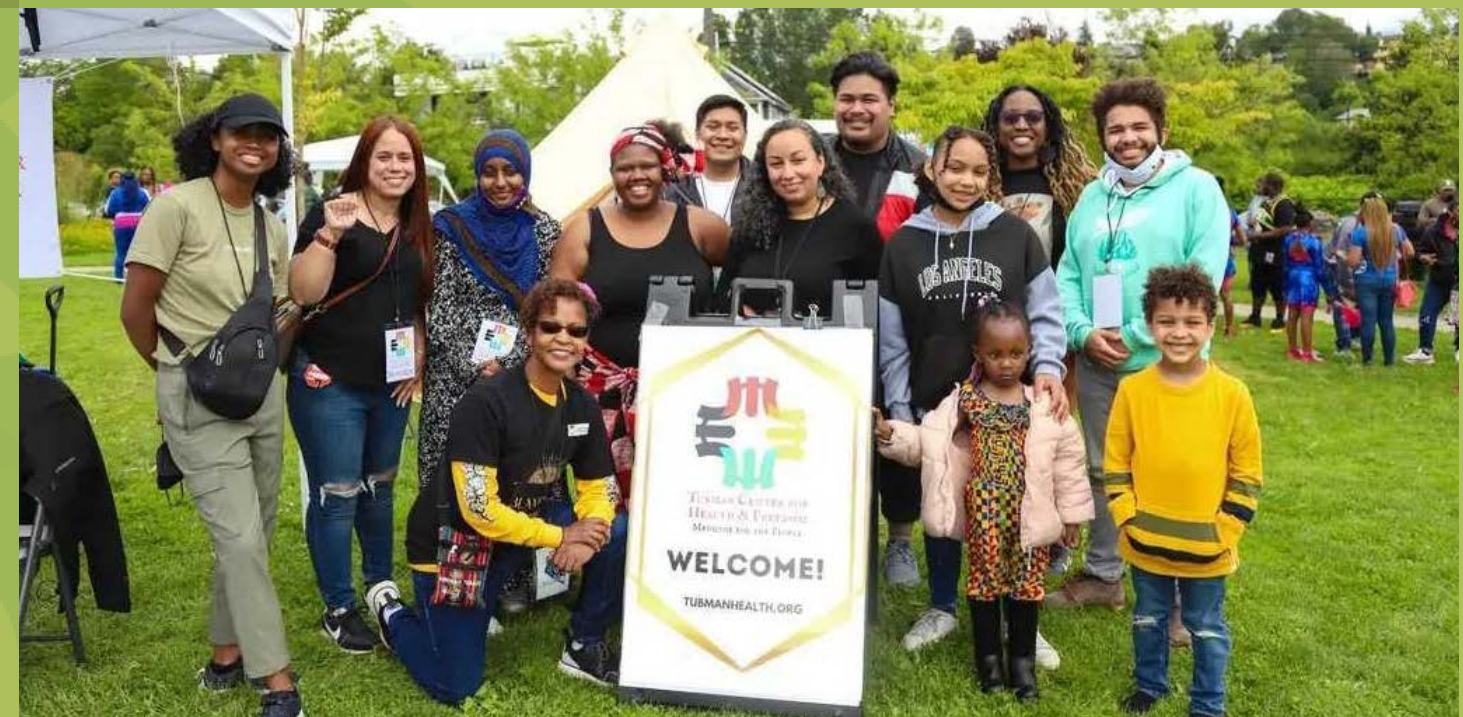
Staff from Tubman Center for Health & Freedom at a community event