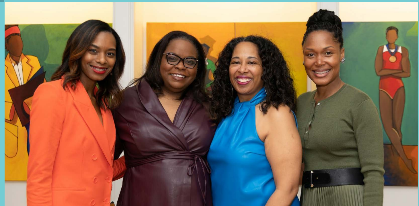
Founders and architects of the Black Future Co-op Fund