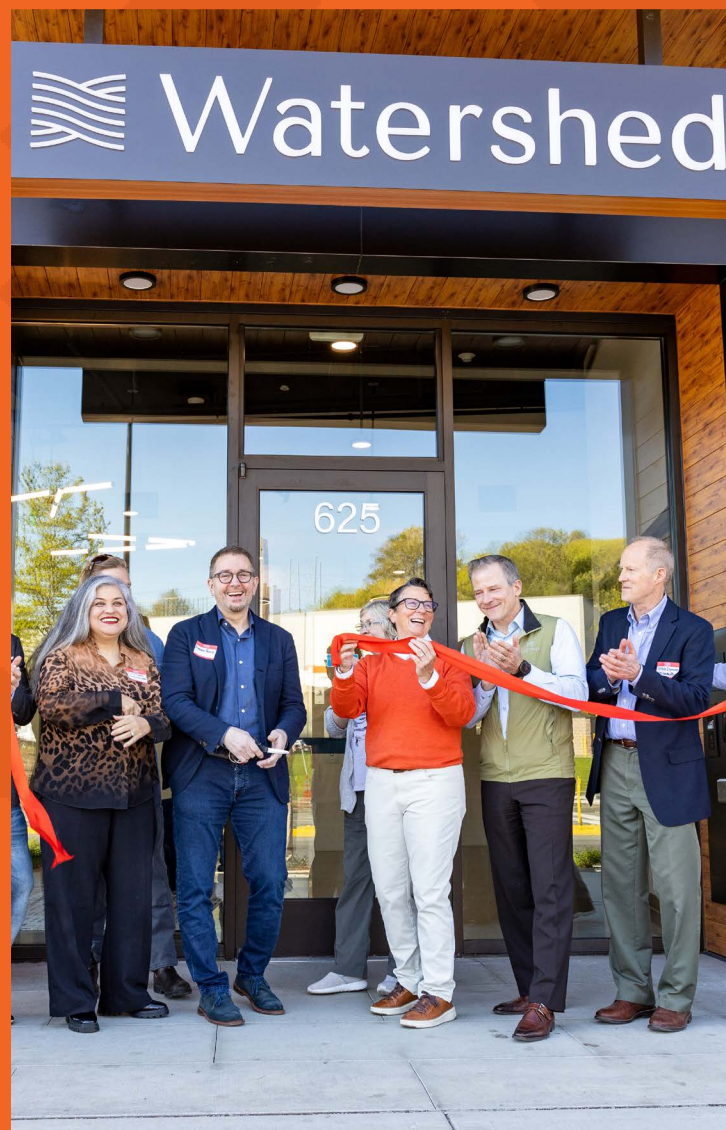
Evergreen Impact Housing Fund (EIHf), GMD Development, and partners celebrated the grand opening of Watershed in Renton. Watershed was the second EIHf-supported project to open to families.