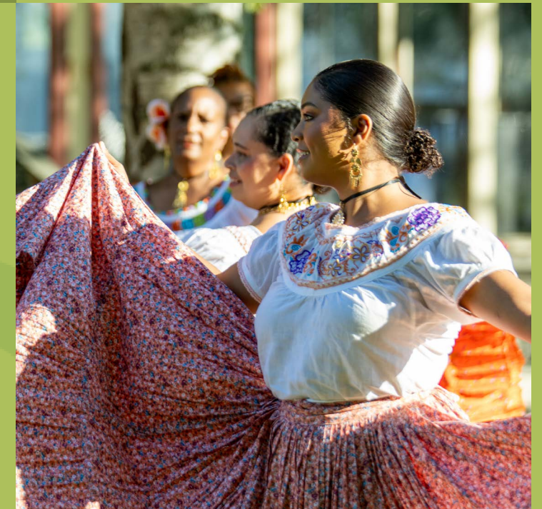
N2N Grantee Panama Folklore entertains the crowd at the annual grantee convening.

The Fund for Inclusive Recovery is a pooled fund guided by a Community Advisory Group that helps meet the critical needs of people most impacted by the pandemic. The Fund drives investments to BIPOC organizations, movements, and communities, creating a pathway for Greater Seattle's inclusive recovery. As part of a $12 million commitment over three years to the first set of grantees, the Fund for Inclusive Recovery made its second year of grants of $4 million to 20 organizations. These grants support community power and base-building approaches that create the necessary foundation for systems and policy