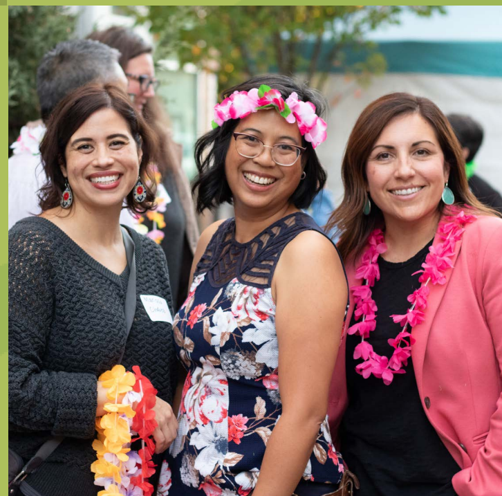
Participants at More Equitable Democracy's Electoral Justice in King County Event