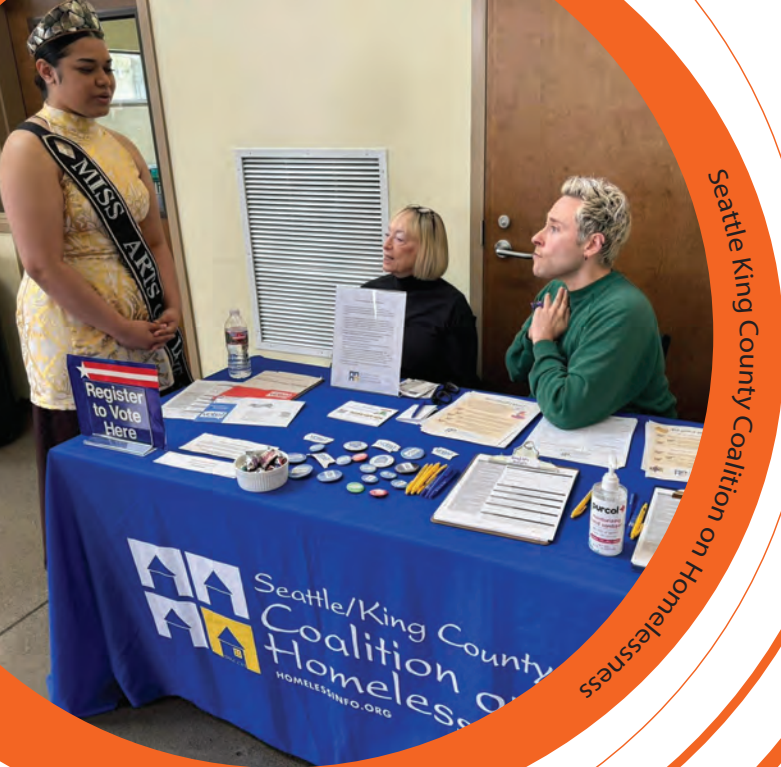
Seattle King County Coalition on Homelessness