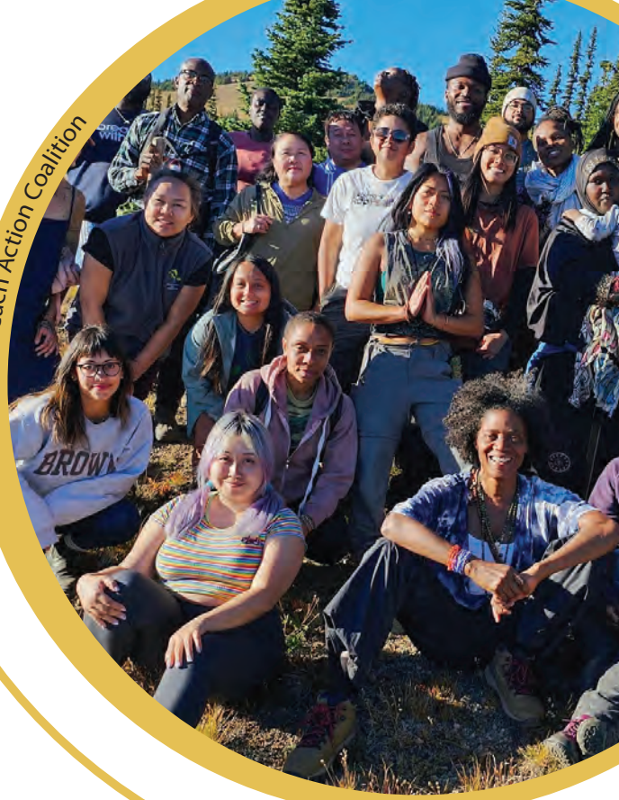
Rainier Beach Action Coalition

A focus on a strong base, collective power and cross-movement connections