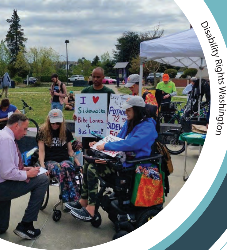
Disability Rights Washington